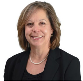
Mayor Terri Cooper