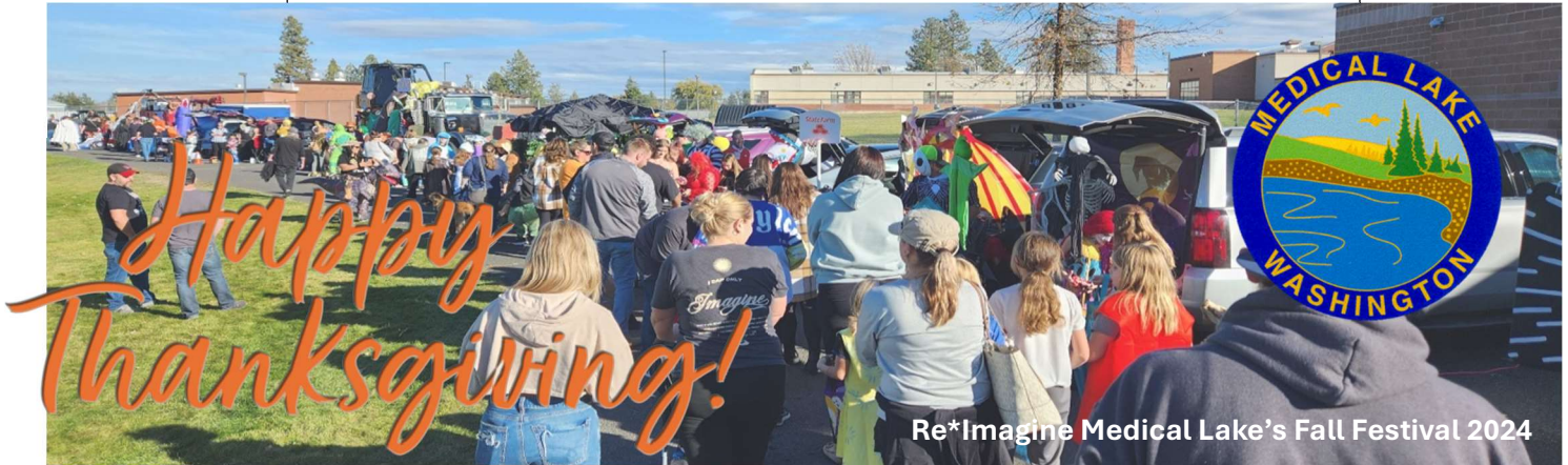
Re*Imagine Medical Lake's Fall Festival 2024