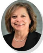
Mayor Terri Cooper