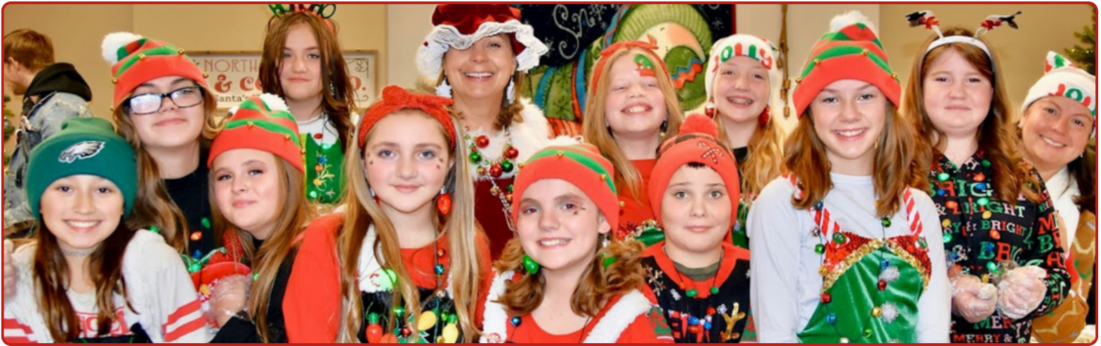
Medical Lake Middle School Students Suit Up as Elves to Serve During Winter Festival